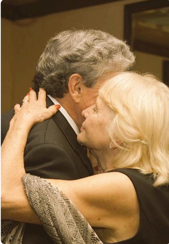
A marriage of a lifetime